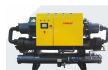
Cooling water machine